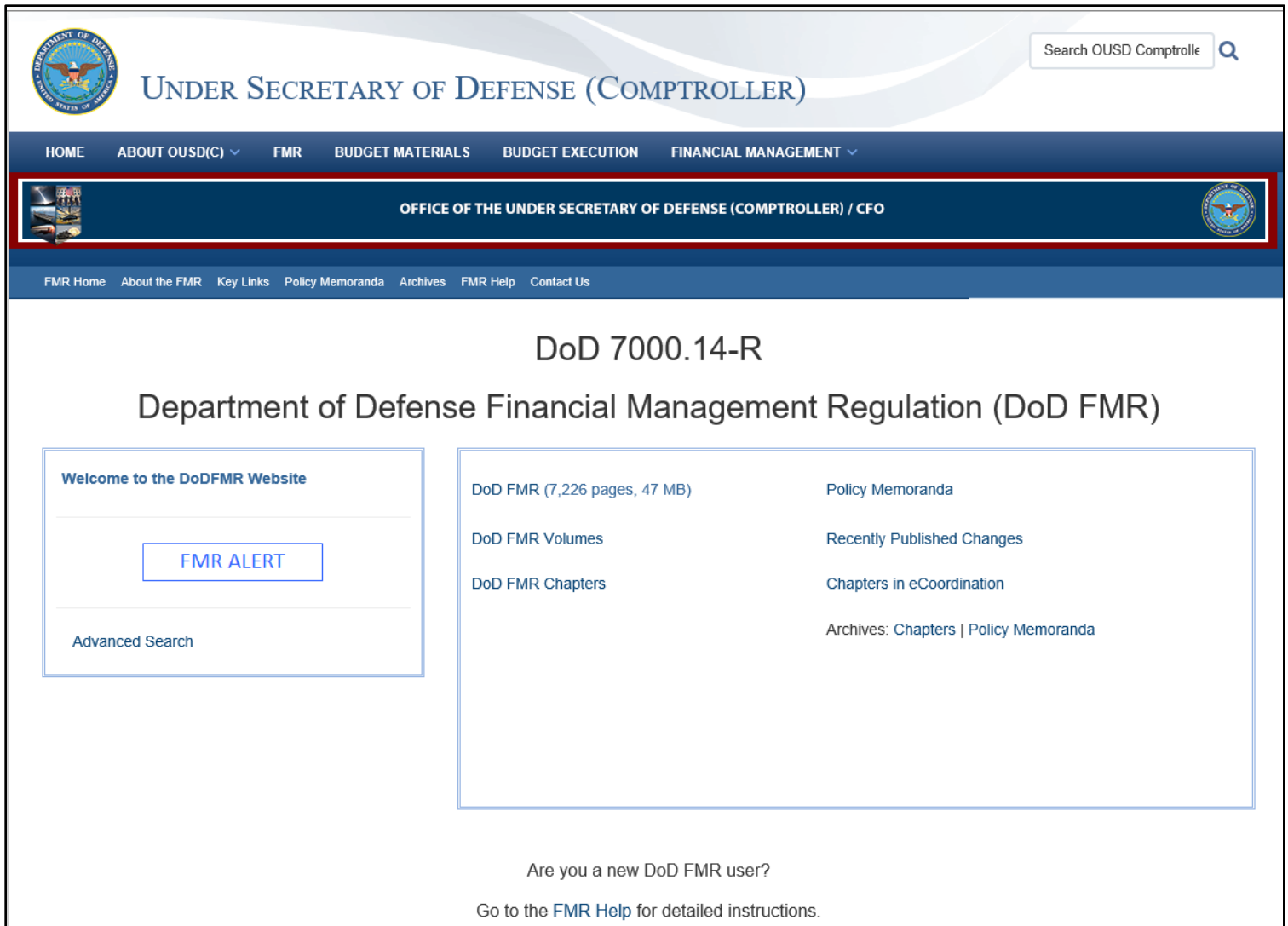
Figure 1. DoD FMR Home Page