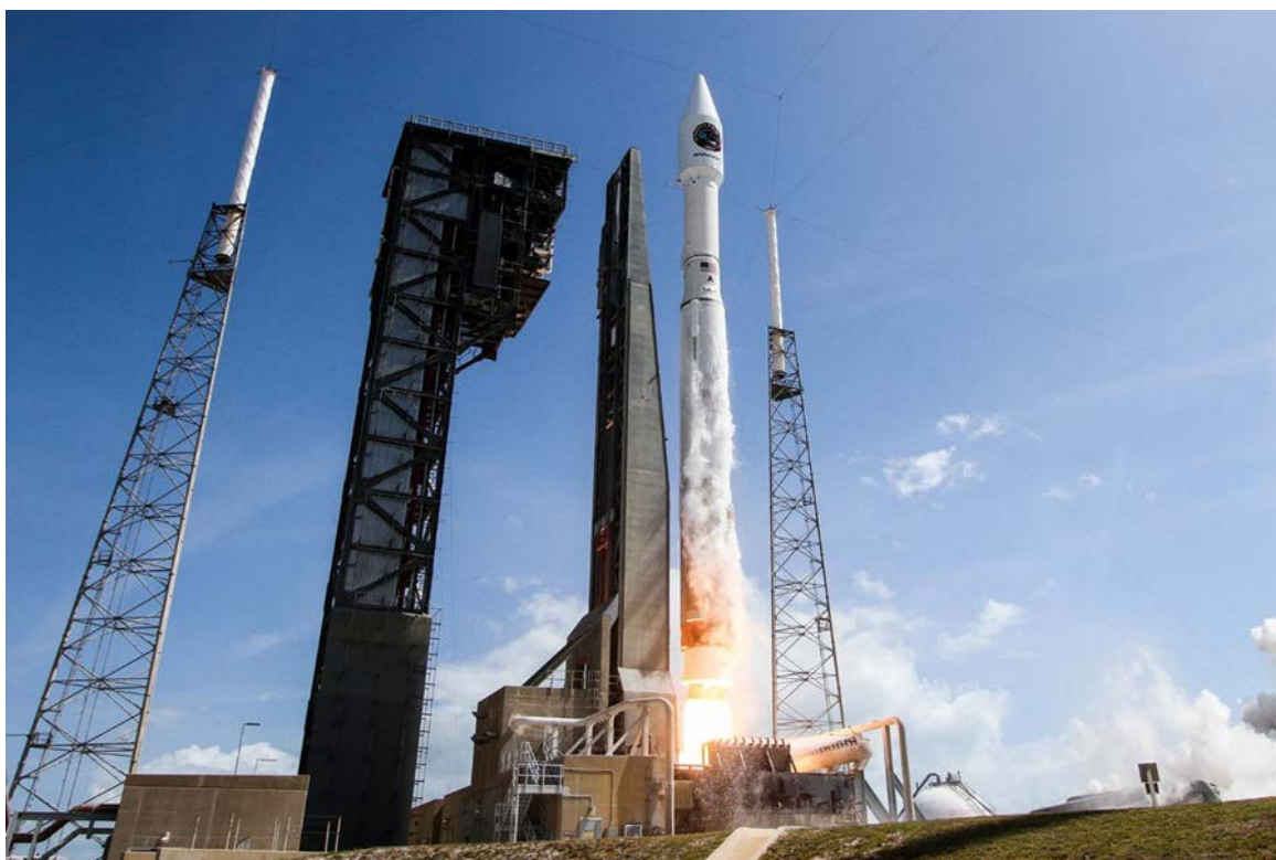
The U.S. Air Force's 45th Space Wing supported NASA's successful launch of Orbital ATK's Cygnus spacecraft aboard a United Launch Alliance Atlas V rocket from Space Launch Complex 41 here April 18 at 11:11 a.m. ET.