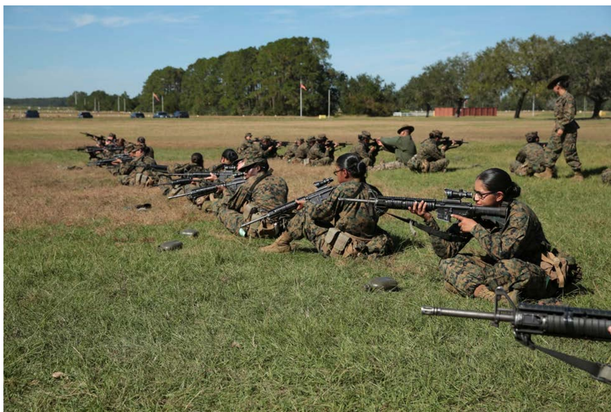
U.S. Marine Corps Recruits from Platoon 4045, N. Co., 4th Battalion, Recruit Training Regiment, practice sighting in on the range at Marine Corps Recruit Depot Parris Island, S.C., Oct. 24, 2016. Qualifying with the M16-A4 Service Rifle teaches recruits to understand the weapon system in order to keep with the concept “Every Marine a Rifleman”.

Other Federal Employment Benefits primarily consists of an estimated liability for incurred-but-not-reported medical claims not processed prior to fiscal year-end and accrued pensions and annuities.