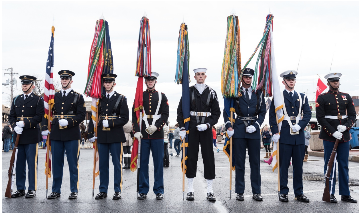
Members of a Joint Service Color Guard prepare to participate in a parade before the 2016 Military Bowl at the Navy – Marine Corps Memorial Stadium in Annapolis, Md., Dec. 27, 2016. The Wake Forest Demon Deacons defeated the Temple Owls 34-26.