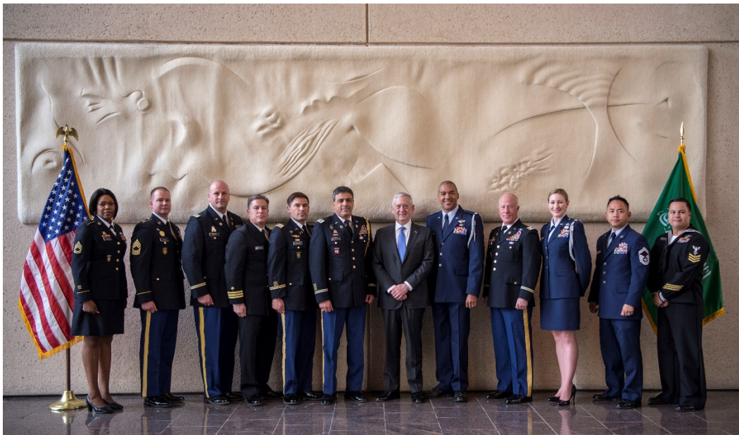
Secretary of Defense Jim Mattis meets with Marines at the U.S. embassy in Riyadh, Saudi Arabia, April 19, 2017.

Published with the Department's annual budget submission in February 2018, the Annual Performance Report will provide a detailed description of performance measures and FY 2017 results.