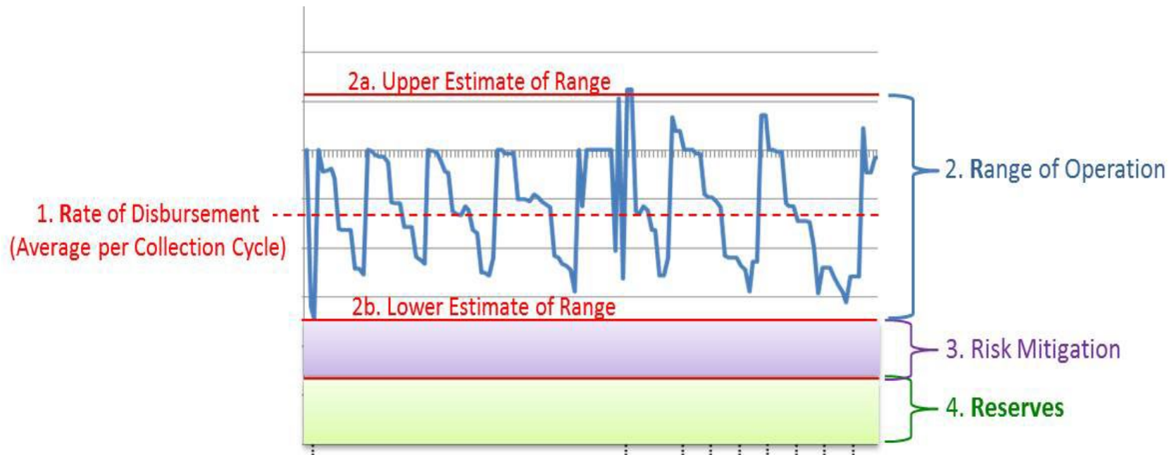
Graphic Display of Elements included in Exhibit 13b, Cash Requirements