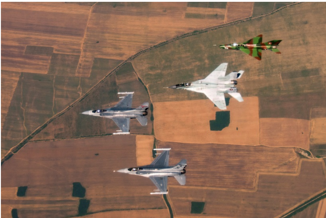
Two U.S. Air Force F-16C Fighting Falcons lead a mixed formation including a Bulgarian air force MiG-29 Fulcrum and MiG-21 Fishbed during Thracian Star 2015 over Bulgaria, July 20, 2015.