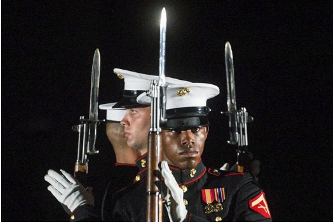
The Marine Corps Silent Drill Team performs during the evening parade at Marine Barracks Washington, D.C.