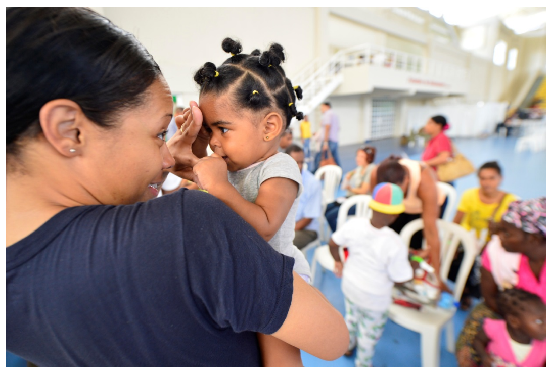
A hospital corpsman interacts with a young patient at a medical site during Continuing Promise 2015 in Santo Domingo, Dominican Republic. The exercise focused on humanitarian-civil assistance, subject matter expert exchanges, medical, dental, veterinary and engineering support, and disaster response to partner nations, showing U.S. support to Central and South America and the Caribbean.